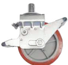
8" Caster Wheel with Dual Brake